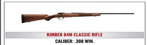
KIMBER 84M CLASSIC RIFLE CALIBER: .308 WIN.

Big Shooters Package - $360 2 Dinner Tickets ($90 Value) and Heston Bucket Package ($500 Value) Pay by 3/12 for 15 chances on 4 Blue Bucket Guns and 1 chance on Super Red Bucket Gun a Kimber 84M 308!