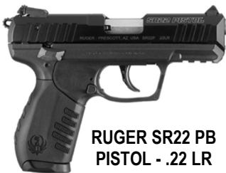
RUGER SR22 PB PISTOL - .22 LR