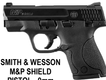
SMITH & WESSON M&P SHIELD PISTOL - 9mm