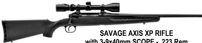
SAVAGE AXIS XP RIFLE with 3-9x40mm SCOPE - .223 Rem

CHANCES FOR THESE GUNS ARE ONLY AVAILABLE WITH OUR EARLY BIRD SPECIAL PACKAGES!