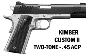
KIMBER CUSTOM II TWO-TONE - .45 ACP

ONE WINNER DRAWN WILL HAVE THEIR CHOICE OF ONE OF THESE GREAT KIMBERS!