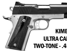
KIMBER ULTRA CARRY II TWO-TONE - .45 ACP