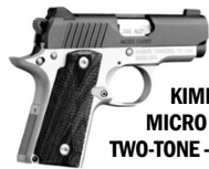
KIMBER MICRO CARRY II TWO-TONE - .380 ACP

Only 150 Chances Sold $20 each 3 for $50