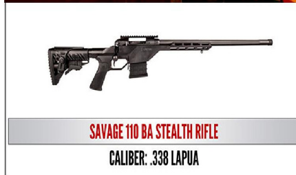
SAVAGE 110 BA STEALTH RIFLE CALIBER: .338 LAPUA