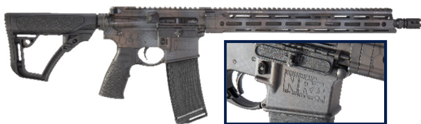
Daniel Defense M4 Carbine V7 5.56mm NATO Rifle

Rattlecan™ Cerakote, Friends of NRA "2017 Gun of the Year" engraving, and custom NRA serialization