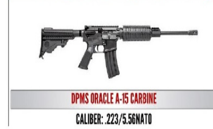
DPMS ORACLE A-15 CARBINE CALIBER: .223/5.56NATO