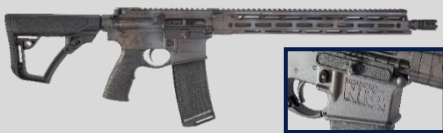
Daniel Defense M4 Carbine V7 5.56mm NATO Rifle Rattlecan™ Cerakote, Friends of NRA "2017 Gun of the Year" Engraving & custom NRA serialization