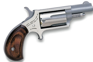
(I) NAA Mini Revolver .22 mag