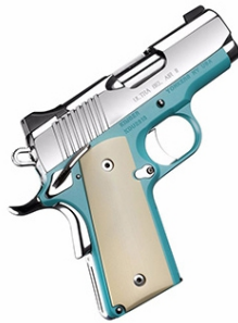
(B) Kimber Ultra Bel Air II 9mm