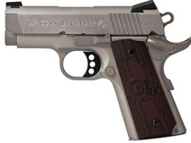
(A) Colt Defender .45acp