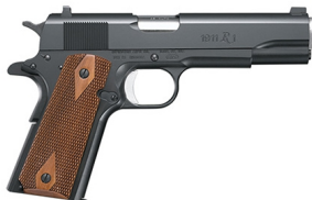
(D) Remington R1 .45acp