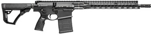
Daniel Defense DD5V1 7.62x51 / .308