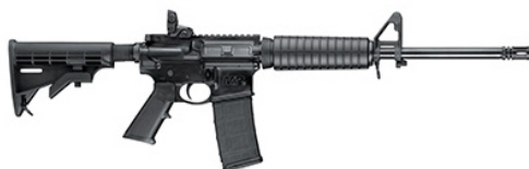
(E) S&W M&P15 Sport II 5.56