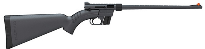
(J) Henry Survival Rifle .22lr