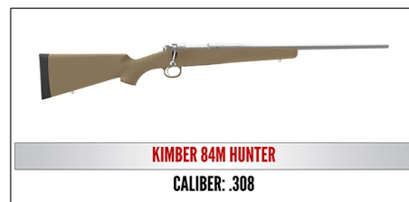
KIMBER 84M HUNTER CALIBER: .308

1 st Winner: Kimber 84m Hunter .308 2 nd Winner: Colt Gov't .45acp 3 rd Winner: Glock 43 9mm