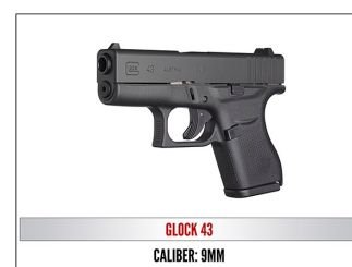
GLOCK 43 CALIBER: 9MM