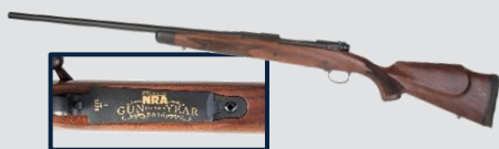
Montana Rifle American Legends .300 Win Mag Rifle Gold Cerakote Embellishment and Custom NRA Serialization