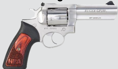
Ruger GP100 Double Action .357!