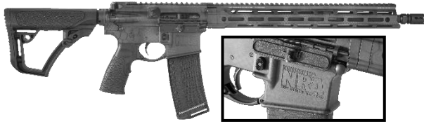
Daniel Defense M4 Carbine V7 5.56mm NATO Rifle

Rattlecan™ Cerakote, Friends of NRA "2017 Gun of the Year" engraving, and custom NRA serialization