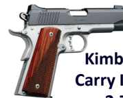
Kimber Ultra Carry II .45acp 2-Tone