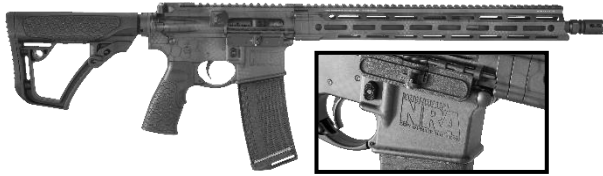
Daniel Defense M4 Carbine V7 5.56mm NATO Rifle

Rattlecan™ Cerakote, Friends of NRA "2017 Gun of the Year" engraving, and custom NRA serialization