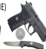
Limited Edition Sig Sauer P229 Legion 9mm with Legion Case, Knife and Coin*