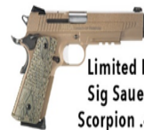
Limited Edition Sig Sauer 1911 Scorpion .45 ACP*