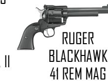
RUGER BLACKHAWK 41 REM MAG