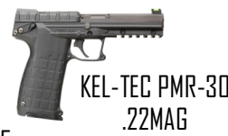
KEL-TEC PMR-30 .22MAG