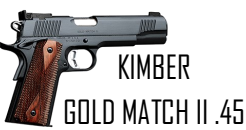
KIMBER GOLD MATCH II .45