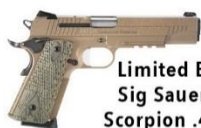
Limited Edition Sig Sauer 1911 Scorpion .45 ACP*