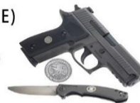
Limited Edition Sig Sauer P229 Legion 9mm with Legion Case, Knife and Coin*