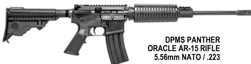
DPMS PANTHER ORACLE AR-15 RIFLE 5.56mm NATO / .223