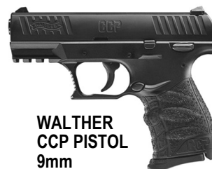
WALTHER CCP PISTOL 9mm

GET CHANCES TO WIN THESE EARLY BIRD GUNS WITH OUR EARLY BIRD SPECIAL PACKAGES!