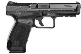
CENTURY ARMS TP9SF CALIBER: 9MM