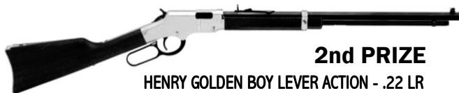
2nd PRIZE HENRY GOLDEN BOY LEVER ACTION - .22 LR