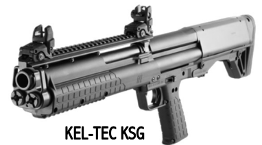
KEL-TEC KSG 12 GAUGE SHOTGUN