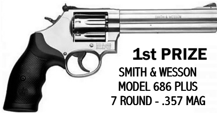
1st PRIZE SMITH & WESSON MODEL 686 PLUS 7 ROUND - .357 MAG

PLUS 3 TICKETS FOR THE BONUS GUN DRAWING