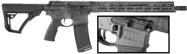
Daniel Defense M4 Carbine V7 5.56mm NATO Rifle

Rattlecan™ Cerakote, Friends of NRA "2017 Gun of the Year" engraving, and custom NRA serialization