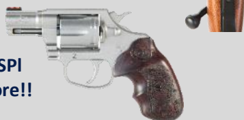
Colt Cobra® Double Action .38 S&P ... and much, much more!!

See the entire 2017 Standard Package Items @ http://friendsofnra.org/merchandise.aspx