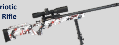
Cricket™ Patriotic Precision .22LR Rifle