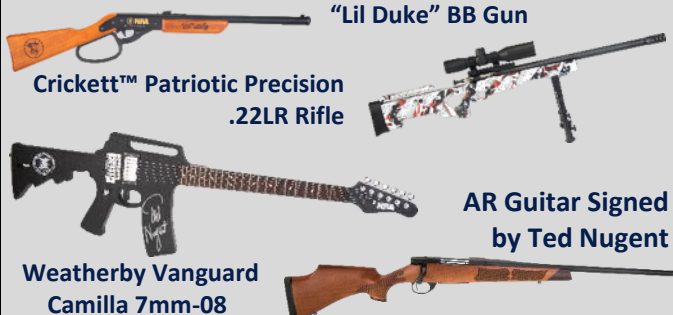
"Lil Duke" BB Gun

Ask about Custom Sponsor Options and Night-of ONLY Limited Edition Merchandise!