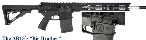
The AR15's "Big Brother"