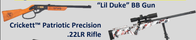
"Lil Duke" BB Gun

Ask about Custom Sponsor Options and Night-of ONLY Limited Edition Merchandise!