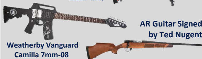
Weatherby Vanguard Camilla 7mm-08