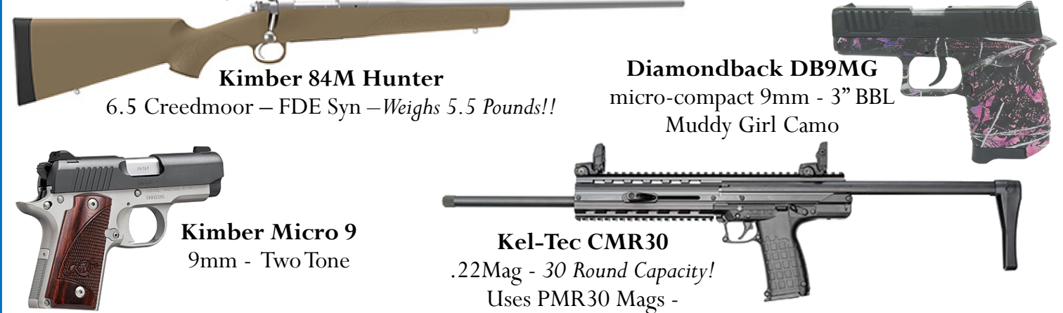
Kimber 84M Hunter 6.5 Creedmoor - FDE Syn - Weighs 5.5 Pounds!!

Only 350 Tickets Available @ $20ea -OR- (3) for $50