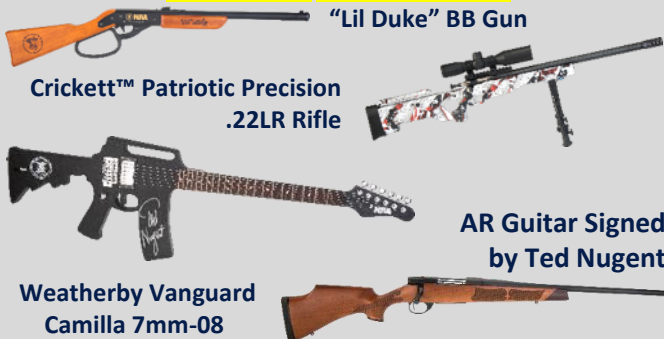
Crickett™ Patriotic Precision .22LR Rifle

Ask about Custom Sponsor Options and Night-of ONLY Limited Edition merchandise such as: