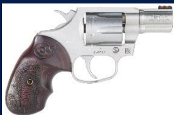
NRA Limited Edition Colt Cobra Double Action .38 Spl Revolver Colt's triumphant return to the world of double-action revolvers.

$20/chance, 3/$50 or 7/$100 Limited to 250