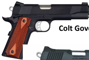
Colt Government .45acp