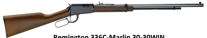
Remington 336C-Marlin 30-30WIN