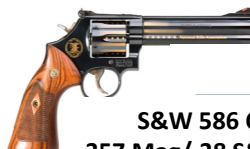
S&W 586 Classic .357 Mag/.38 S&W Special