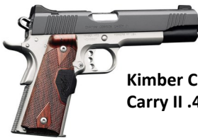
Kimber Custom Crimson Carry II .45acp