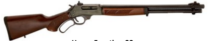
Henry Frontier .22mag