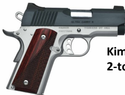
Kimber Ultra Carry II 2-tone .45acp