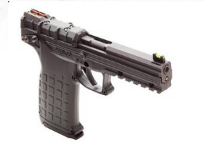
KelTec PMR 30 .22 mag