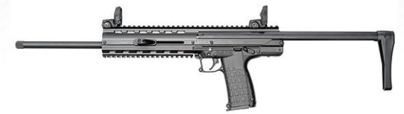
KelTec CMR 30 .22 mag