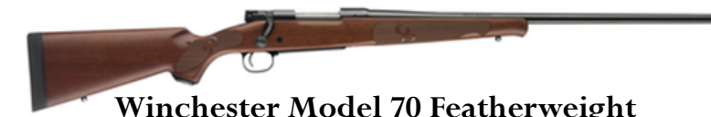
Winchester Model 70 Featherweight .300 Win Mag - 24" BBL -Pre-'64 style Action Walnut Stock - Schnabel Forearm