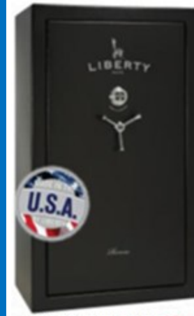
HOLDS UP TO 30 GUNS* Liberty "Revere" Gun Safe

Only 450 Tickets Available @ $20ea -OR- (3) for $50