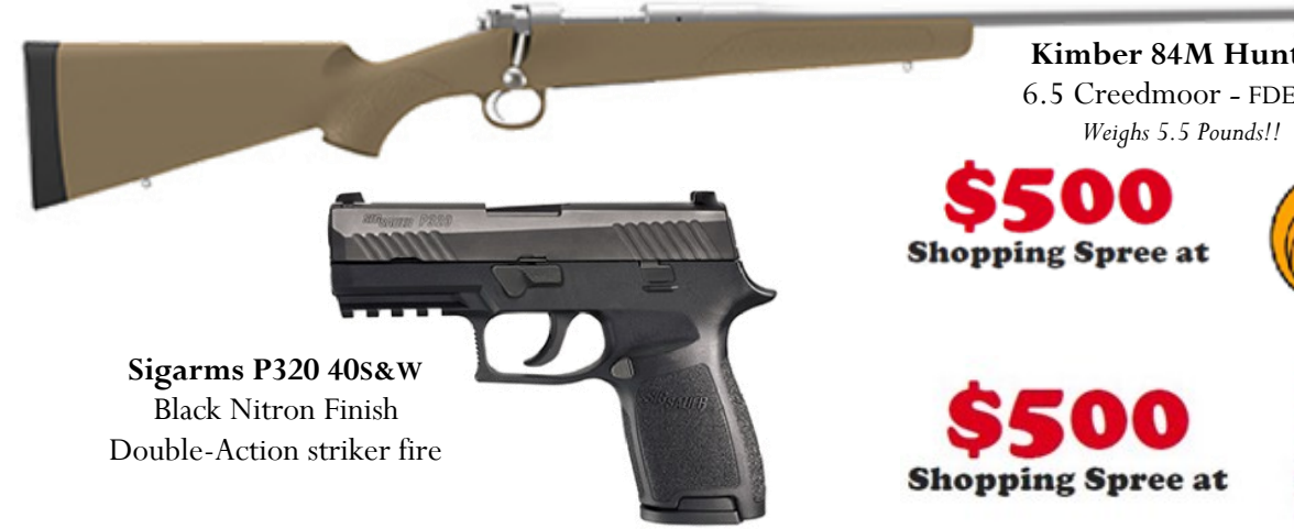
Kimber 84M Hunter 6.5 Creedmoor - FDE Syn Weighs 5.5 Pounds!!