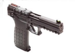
KelTec PMR 30 .22 mag