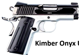
Kimber Onyx Ultra Carry II .45acp