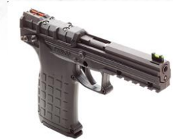
KelTec PMR 30 .22 mag