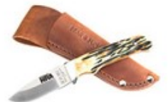
Fixed Blade Skinner with Logo