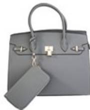
Concealed Carry Purse