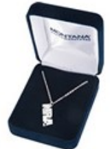
Silver NRA Necklace