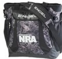
Backpack Cooler Bag with Logo