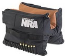
Bench Bag with Friends of NRA Logo