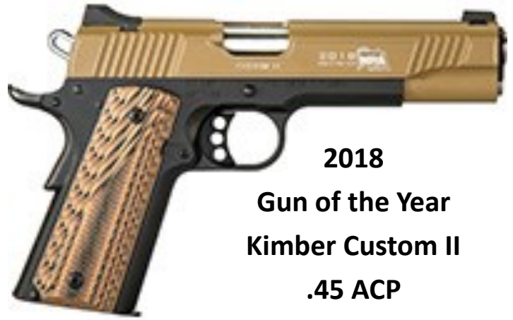
2018 Gun of the Year Kimber Custom II .45 ACP