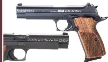
Sig Sauer P210 American Standard 9mm Target