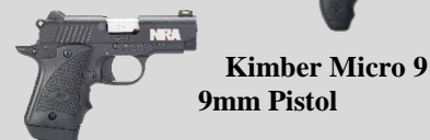
Kimber Micro 9 9mm Pistol

Charlie Daniels "Simple Man" personally autographed framed lyrics ..and much, much more!!