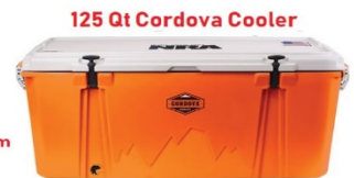
125 Qt Cordova Cooler

We are running a pre-event raffle that is winner take all for 8 Guns and a 125 Qt Cooler. You don’t have to be present to win and we will sell no more than 300 Tickets. So, even if you can’t make it this year, you can still take a chance on almost $6000 in prizes and support your favorite cause. Tickets for the pre-event are $50. You can order your them with the enclosed order form or online at www.gcfnra.org