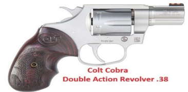
Colt Cobra Double Action Revolver .38