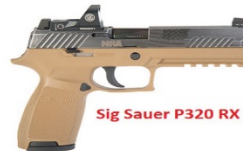
Sig Sauer P320 RX 9mm