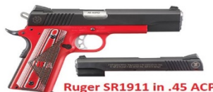
Ruger SR1911 in .45 ACP