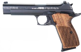
Sig Sauer P210 American Standard 9mm Pistol with Logo Engraved with Friends of NRA and 2019 Gun of the Year on slide.