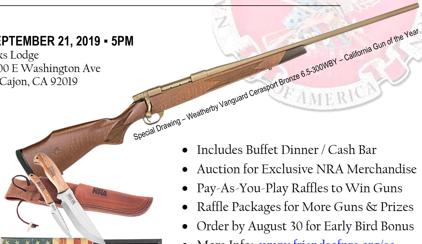
Special Drawing – Weatherby Vanguard Cerasport Bronze 6.5-300WBV – California Gun of the Year

Elks Lodge 1400 E Washington Ave El Cajon, CA 92019