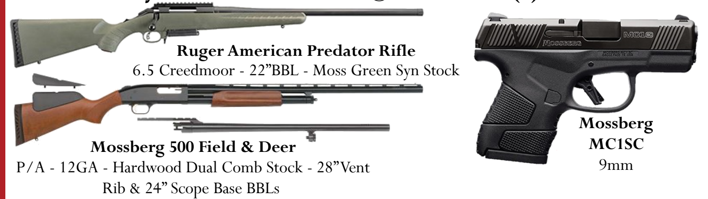
Ruger American Predator Rifle

Only 300 Tickets Available @ $20ea -OR- (3) for $50