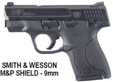
SMITH & WESSON M&P SHIELD - 9mm

Rules to Enter: Both you and a person who has never attended this event (age 18 & over) must have a paid ticket and be in attendance at the Northwestern Illinois Friends of NRA Event on 3/2/19. Only one gun will be awarded.