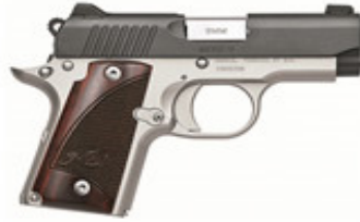
KIMBER MICRO 9 TWO-TONE CALIBER: 9 MM