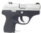
BERETTA PICO INOX WITH BLACK FRAME CALIBER: .380 ACP