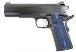
COLT COMPETITION BLUE 45 ACP CALIBER: .45 ACP