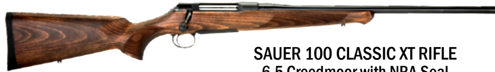
SAUER 100 CLASSIC XT RIFLE 6.5 Creedmoor with NRA Seal