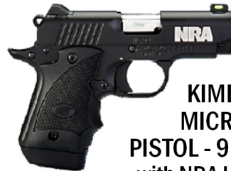
KIMBER MICRO 9 PISTOL - 9mm with NRA Logo