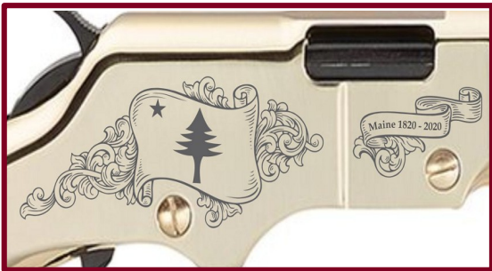
RIGHT- Original Maine State Flag and "Maine 1820-2020"

Maine 200 th Anniversary Edition (only 15 will be made)