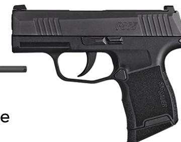
Sig P365 Nitron - 9mm