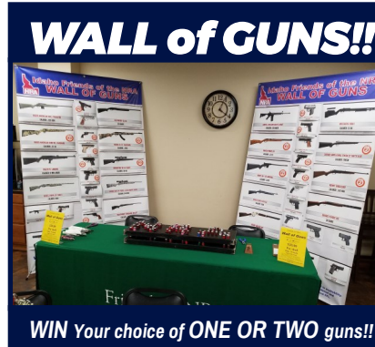
WIN Your choice of ONE OR TWO guns!!