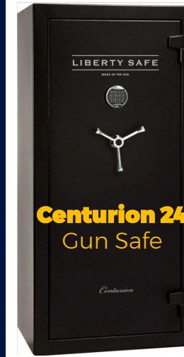
Centurion 24 Gun Safe

Only 450 Tickets Available @ $20ea -OR- (3) for $50