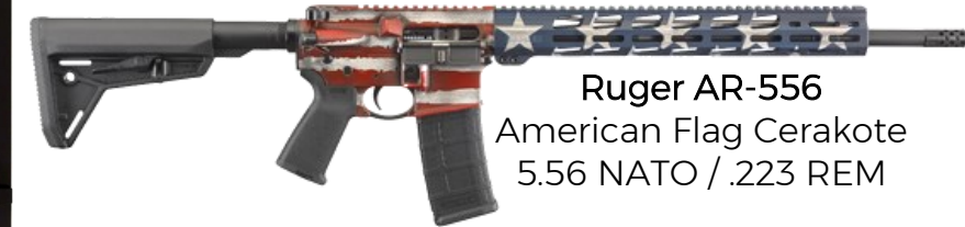
Ruger AR-556 American Flag Cerakote 5.56 NATO / .223 REM