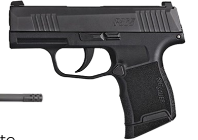
Sig P365 Nitron - 9mm