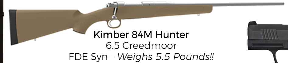
Kimber 84M Hunter 6.5 Creedmoor FDE Syn - Weighs 5.5 Pounds!!