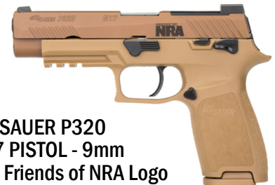
SIG SAUER P320 M17 PISTOL - 9mm with Friends of NRA Logo

Drawing held 2/16/2020 - Utica, IL. Need Not Be Present To Win.