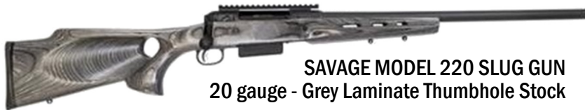
SAVAGE MODEL 220 SLUG GUN 20 gauge - Grey Laminate Thumbhole Stock