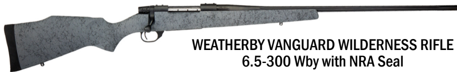
WEATHERBY VANGUARD WILDERNESS RIFLE 6.5-300 Wby with NRA Seal

One Winner Drawn for Choice 150 CHANCES SOLD! $20 each / 3 for $50