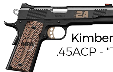
Kimber Pro Carry II .45ACP - "TEAM 2A" logo