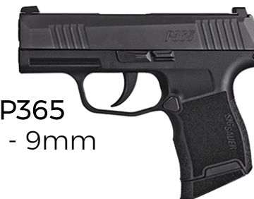
Sig P365 Nitron - 9mm