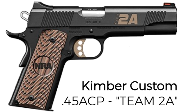
Kimber Custom II .45ACP - "TEAM 2A" logo