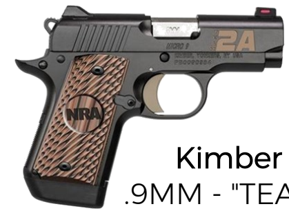
Kimber Micro 9 .9MM - "TEAM 2A" logo

This is a TWO FOR ONE Raffle!!! One Winning Ticket Wins BOTH Guns!!!