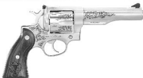
Ruger® Redhawk® Double-Action 44 Magnum Revolver with NRA Seal