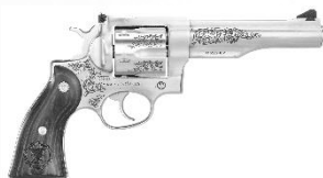
Ruger® Redhawk® Double-Action 44 Magnum Revolver with NRA Seal