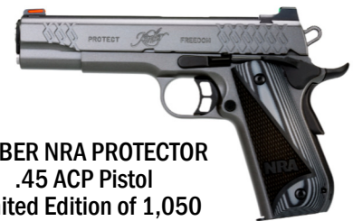
KIMBER NRA PROTECTOR .45 ACP Pistol Limited Edition of 1,050

Drawing held 3/15/20 - Joliet, IL. Need Not Be Present To Win.