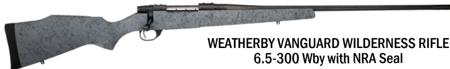
WEATHERBY VANGUARD WILDERNESS RIFLE 6.5-300 Wby with NRA Seal