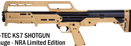
KEL-TEC KS7 SHOTGUN 12 gauge - NRA Limited Edition