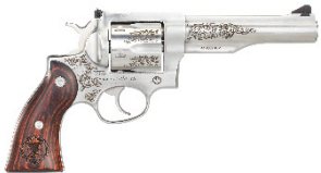
Ruger® Redhawk® Double-Action 44 Magnum Revolver with NRA Seal